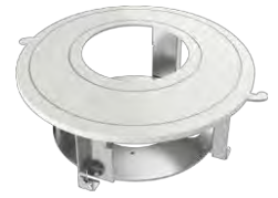
DS-1227ZJ-DM42 In-Ceiling Mount