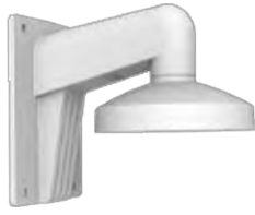
DS-1473ZJ-155-Y Pendant Mount