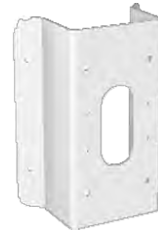
DS-1476ZJ-Y Corner Mount