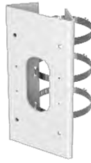
DS-1475ZJ-Y Vertical Pole Mount