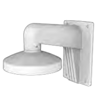
DS-1473ZJ-155 Wall Mount