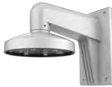
DS-1473ZJ-155-Y Wall Mount