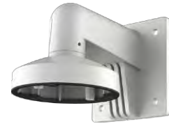
DS-1272ZJ-120-TR15 Wall Mount