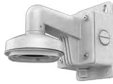
DS-1272ZJ-120B Wall Mount