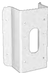
DS-1476ZJ-Y Corner Mount