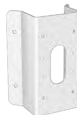
DS-1476ZJ-SUS Corner Mount