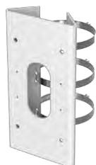
DS-1475ZJ-SUS Vertical Pole Mount