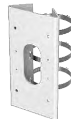
DS-1475ZJ-Y Vertical Pole Mount