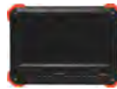
X41T Camera Tester