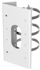
DS-1475ZJ-SUS Vertical Pole Mount