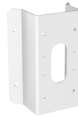
DS-1476ZJ-SUS Corner Mount