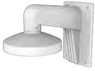
DS-1473ZJ-155 Wall Mount