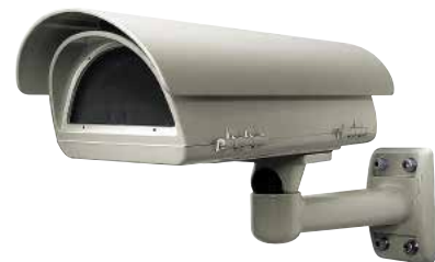
VERSO COMPACT + WBOVA2