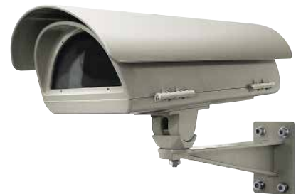
VERSO COMPACT + WBJA