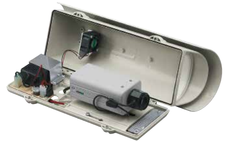
VERSO COMPACT + CAMERA