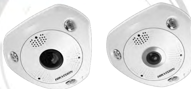
With -V Model