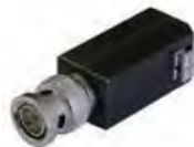
DS-1H18 Video Balun